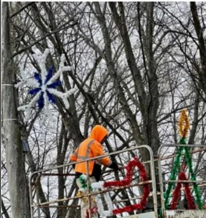
Installation on Menomonie Street